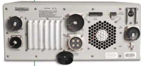
Rear Panel ACG2500 UPS