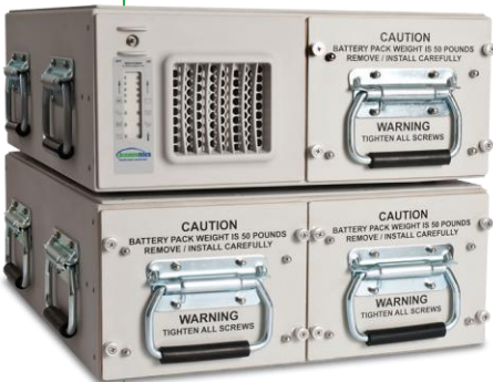
ACG2500R-XR with Optional Extended Battery

Contact Acumentrics to discuss customized solutions.