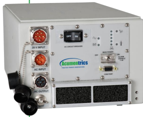
ACG1250 Power Inverter

Contact Acumentrics to discuss customized solutions.