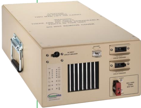
ACT2500 Smart Power Conditioner

Contact Acumentrics to discuss customized solutions.