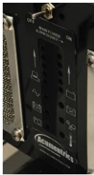
Back Panel 6 x NEMA 5-20R